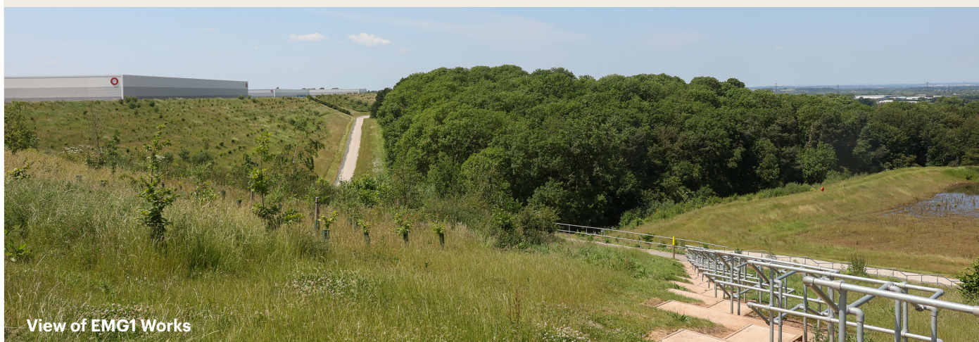
View of EMG1 Works